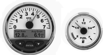
I-Command "Classic" Chrome Bezel / White face