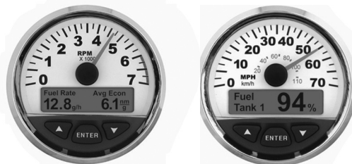
I-Command "Classic" Chrome Bezel / White face

Displayed in Speedometer: 0-70 mph, fuel level %, trip fuel.